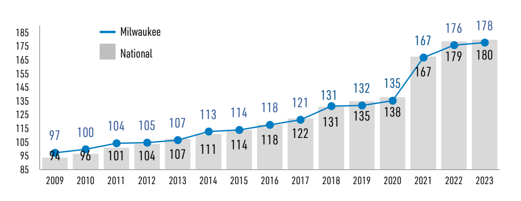
(January 2009 = 100)

The Mortenson Cost Index is showing a single quarter increase of 0.6% nationally and 1.1% in Milwaukee. Over the last twelve months, costs increased 5.0% nationally and 4.2% in Milwaukee.